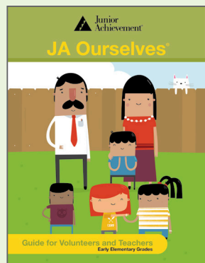
Guide for Volunteers and Teachers